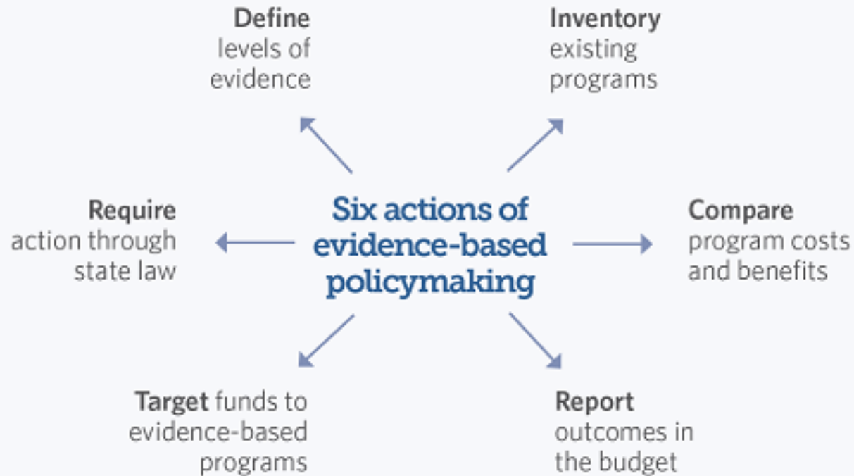
Figure 2 Assessing Evidence-Based Policymaking in the States

Also provided here as recommended guidance for States is Figure 2: Assessing Evidence-Based Policymaking in the States which outlines six actions of evidence-based policymaking.